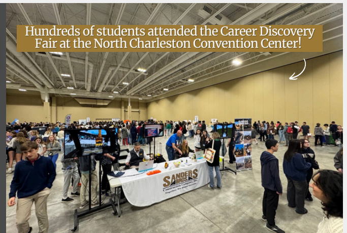
Hundreds of students attended the Career Discovery Fair at the North Charleston Convention Center!

Our HR/Recruiting team has been busy attending career fairs across the Lowcountry, connecting with students and job seekers interested in careers in construction. These events give us the opportunity to share what makes SBCC a great place to work while introducing future professionals to the many opportunities available in our industry. Our upcoming fairs are at Goose Creek High and Cane Bay High . If you know a student, tell them to come say hello!