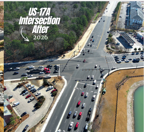
US-17A Intersection After 2026