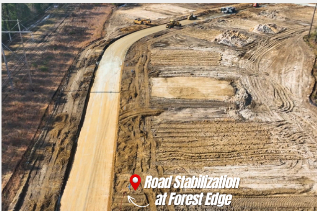
Road Stabilization at Forest Edge