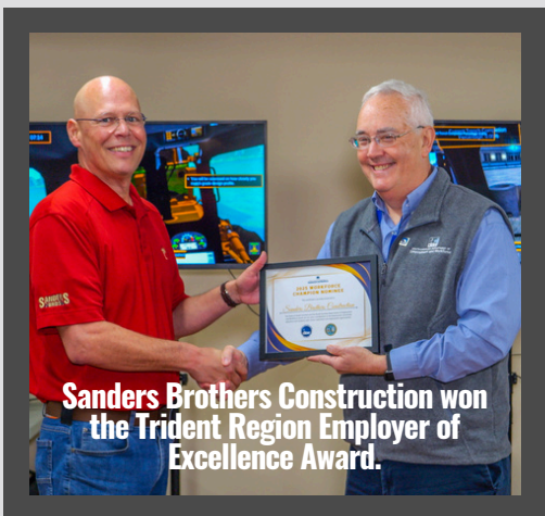
Sanders Brothers Construction won the Trident Region Employer of Excellence Award.