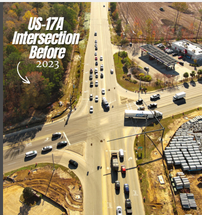
US-17A Intersection Before 2023

The Highway 176 and US 17A intersection project is complete, delivering roadway widening, paving, and overall intersection improvements designed to enhance traffic flow and safety in the area. From start to finish, this transformation reflects the coordination of multiple crews and scopes to bring the project across the finish line with a smooth and durable roadway. BEFORE AND AFTER -