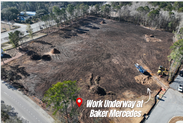
Work Underway at Baker Mercedes